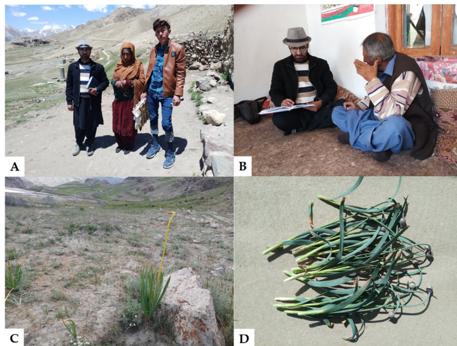
Figure 2. Informants interviewed among the Sarikoli (A,B); Photos of Eremurus stenophyllus (C) and Allium carolinianum (D).

and the collected specimens were identified by the third author with the help of the Flora of Pakistan [22–25]. The specimens were assigned voucher numbers and incorporated into herbaria, subsequently submitted to the Department of Botany, University of Swat, Khyber Pakhtunkhwa, Pakistan. The scientific nomenclature of each taxon was verified through The Plant List database [26] and family assignments were consistent with the Angiosperm Phylogeny Website [27].